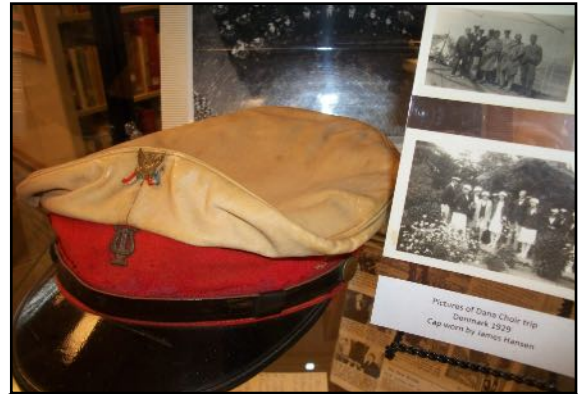
Now on display at the DAAL are exhibits focusing on Dana choir tours and sports as a preview for next year’s exhibits at the Blair library. Caps like this were worn by 1929 choir members.